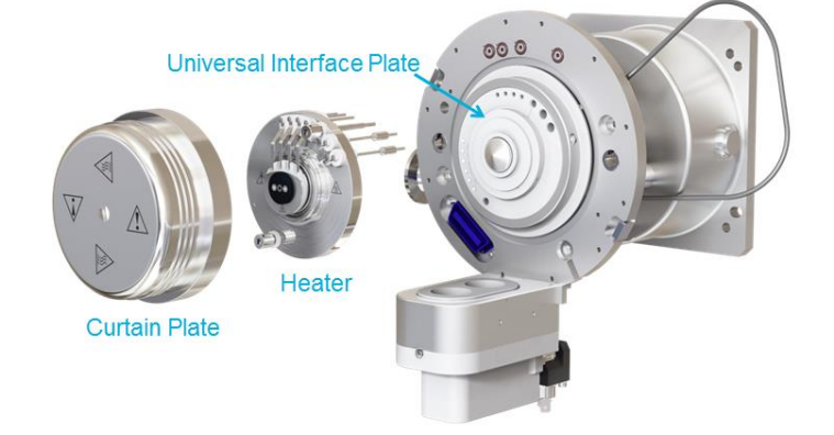
Figure 1. OptiFlow Interface for Rapid Switching Between High Flow and Low Flow Sources. Easily switch between all front end operational modes in minutes, without having to break vacuum. For low flow applications, remove the high flow Curtain Plate, then install the nanoflow heater onto the Universal Interface Plate, and finally install the nanoflow Curtain Plate.