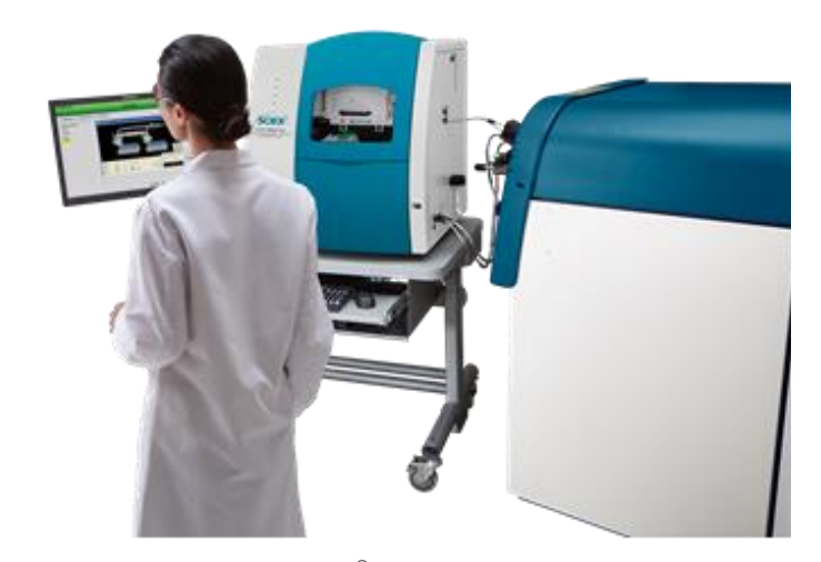
CESI 8000 Plus and TripleTOF® 6600+ System

Figure 1. High sequence coverage of light and heavy chains of Adalimumab using the sample prep and optimized conditions provided in this technical note. Green color: high confidence; Orange color: middle confidence